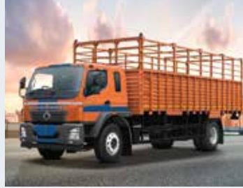
Trucks 6 Units